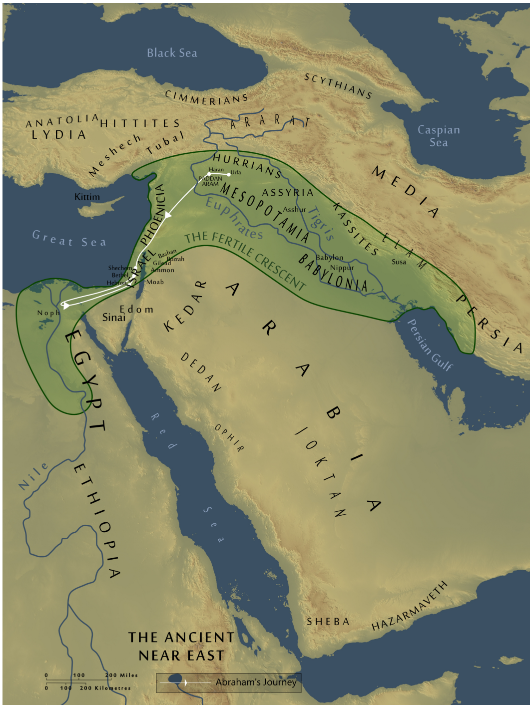
The Ancient Near East