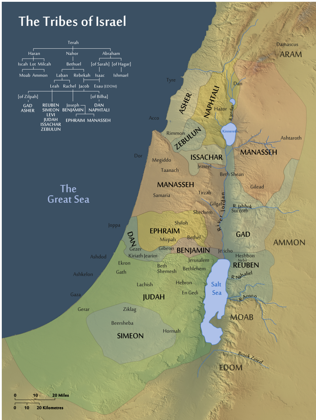
The Tribes Of Israel